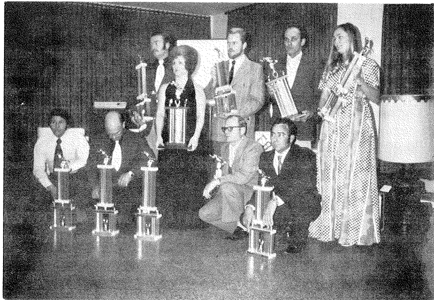
COUNCIL SPEARFISHING CHAMPIONS